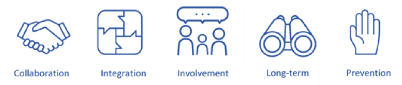
Figure 1: The 5 ways of working from the Well-being of Future Generations Act

Just as when we were preparing the Well-being Assessment, we have used the five ways of working, collaboration, integration, involvement, long-term, and prevention, to guide our work. This means that while considering how to improve well-being in our communities now, we've also looked at how well-being could be affected in the future and how we can prevent issues becoming worse. We will need to work together to see what we're each doing in a community and how this affects what we do, individually and in partnership. Finally, but most importantly, we want our communities, professionals, businesses, and others to identify the issues which are most important to them. As we develop how we will be delivering the Objectives and Steps (regional and local delivery plans) we will continue to use these principles to guide our work.