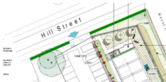
Potential for low hedge planting along Hill Street

5.5.3 Planting & Management Plan 527.03 The planting proposals should fit into the wider Conservation Area character, particularly along the sites public realm boundaries, Park Square to the south and Hill Street to the north. The public car park is not an attractive feature, but trees on grassed banks outside the site provide some green backdrop. Although outside the application boundary, is there is an opportunity for new hedge planting to provide some visual and physical separation between car park and public realm and to reflect wider Conservation Area frontage treatment. This landscape treatment could be continued along the application site boundaries and overall this would be an enhancement – see extent below.